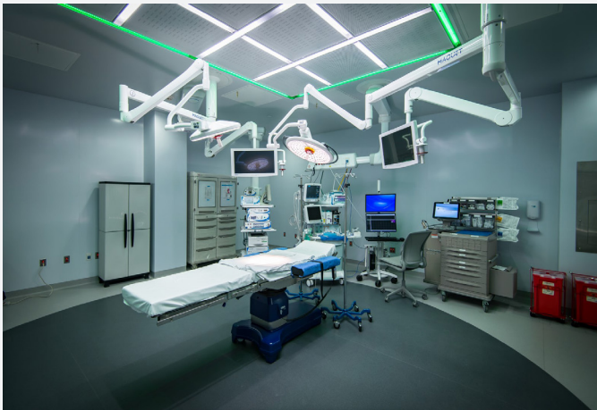
© Billy Economou & NK Architects